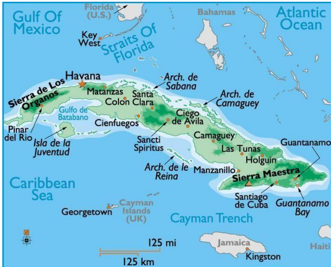
Map of Cuba - 2

Year's War. It is important to understand that the mountains can offer a perfect hideout for a future guerrilla war (employing tactics such as "hit and run"). 8