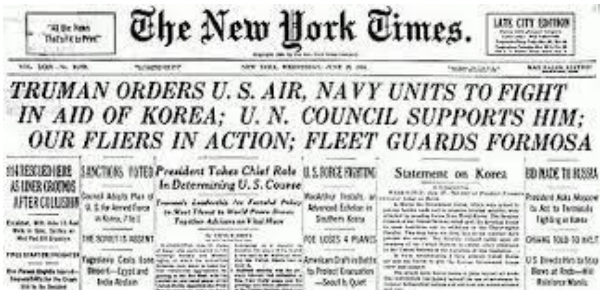
NYT front page after Truman's order to send troops in Korea -10

In an ideal scenario, the organisation of democratic elections would be a significant step towards supporting democratic procedures in Cuba. In order for fair elections to take place, one might argue that they should be UN-organized.