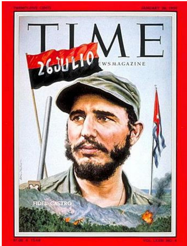
Time Magazine front page, 1950s -8

Founded in 1925, the Cuban Communist Party followed a Stalinist line. When Batista got power, however, during the 1940s and early 50s, the Party openly supported him, and as a result, many members received high-paid government jobs as rewards. After Castro's failed coup, the Party faced persecution by the Batista administration.