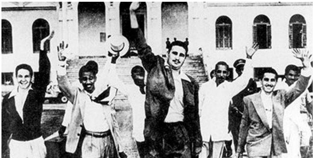
Castro and other rebels released from prison in 1955 -5

He graduated in 1950 and immediately joined the reformist Cuban People's Party and practiced law. Castro planned to run for a seat in the House of Representatives but Batista canceled the 1952 elections, and overthrew the Carlos Prio Socarras government. Since all legal means to power had been eradicated, Castro started organising a rebel group willing to overthrow the dictator.